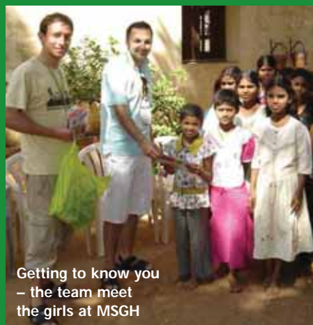
Getting to know you – the team meet the girls at MSGH

On the fourth day, they negotiated with the organisers to miss the morning flag-off, in order to visit Madurai Sevashram Girls Home, the girls' home for which they were raising funds. It was a welcome change of pace, and they were struck by the calmness of the environment and by how contented the girls were. The value of helping the children gain skills and qualifications, so they can be self-supporting when they leave the charity, was very clear to them. The girls were enthusiastic to show them