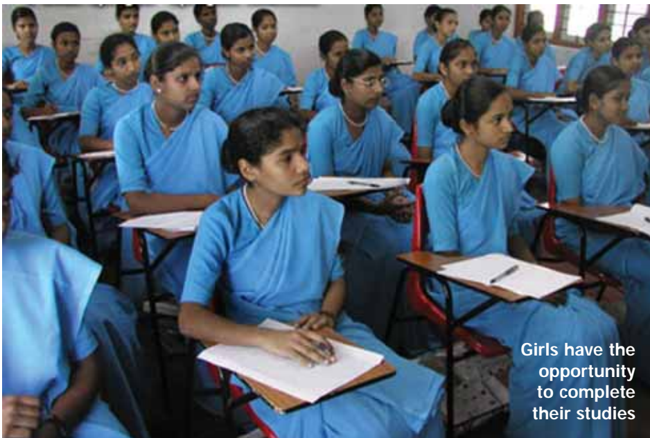
Girls have the opportunity to complete their studies